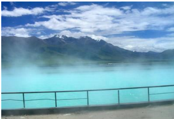
Yangbajing Geothermal Scenic Area

Hotel breakfast, see incredible mountains, huge grasslands, local nomads and yaks. Journey to Nam Tso , China's second largest saltwater lake, on a clear day are magnificent views of nearby mountains. The wide open spaces, dotted with the tents of local Drokpas (Nomads) are intoxicating. On the way back to Lhasa, stop by Yangpachen Hot spring and enjoy the hot spring service on your own arrangement if you wish, evening hotel transfer, overnight Lhasa.